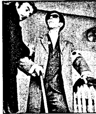
RAY OF HOPE

can be provided with enough useful vision for daily life," he said in a telephone interview.